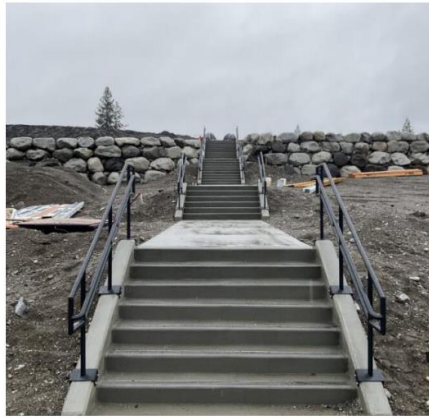
Photos showing work underway in Areas 18/19, and work completed in Areas 14/15