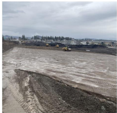
Photos showing relocation of structural fill material from Areas 18/19 to Phase 3