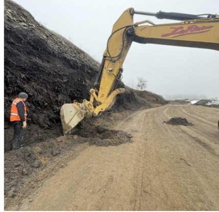
Stabilization efforts for the Centennial Trail on the north side of the Phase 3 site